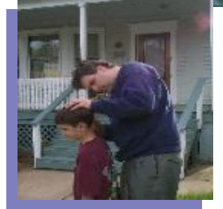
Be sure to do a thorough tick check on children.

For more information contact: the Atlantic County Division of Public Health at 645-5935.